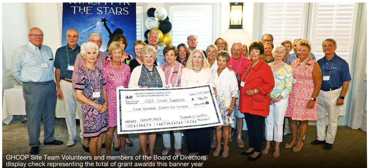
GHCOP Site Team Volunteers and members of the Board of Directors display check representing the total of grant awards this banner year

See photo below of GHCOP Volunteers who participated in team site visits, financial analysts who vetted agencies' budgets, and GHCOP Board Members who work tirelessly to achieve our financial and corporate fundraising goals.