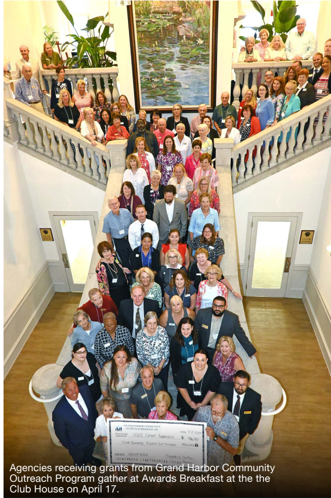
Agencies receiving grants from Grand Harbor Community Outreach Program gather at Awards Breakfast at the Club House on April 17.