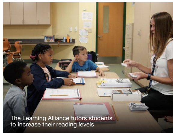
The Learning Alliance tutors students to increase their reading levels.