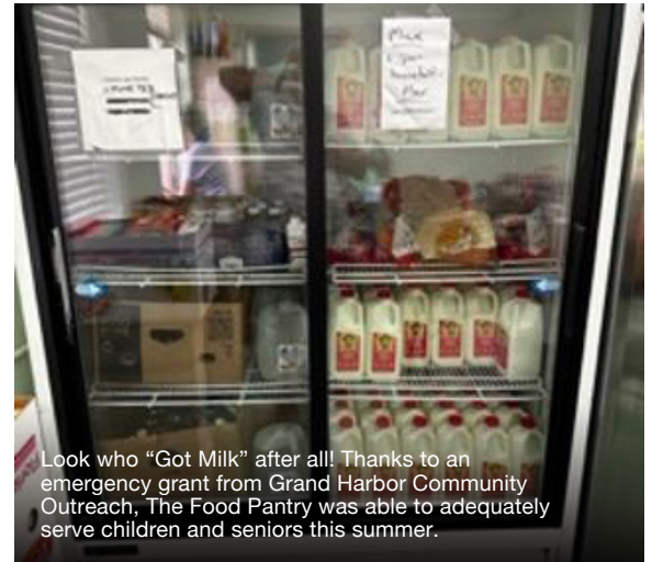
Look who “Got Milk” after all! Thanks to an emergency grant from Grand Harbor Community Outreach, The Food Pantry was able to adequately serve children and seniors this summer.

With your generous 2023 support, GH COP quickly performed its due diligence and awarded a grant of $10,000 to enable the milk program for both families with children and seniors to be reinstated through the end of this year.