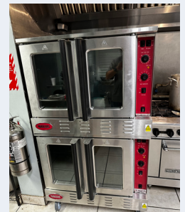
GHCOOP enabled The Source to replace their commercial oven.

They too, in July of this year, made a special request to GHCOOP: the need to cover the cost of a commercial oven for their main kitchen. The existing oven is over 10 years old and not repairable. In that time frame it has been used to prepare over 500,000 meals!